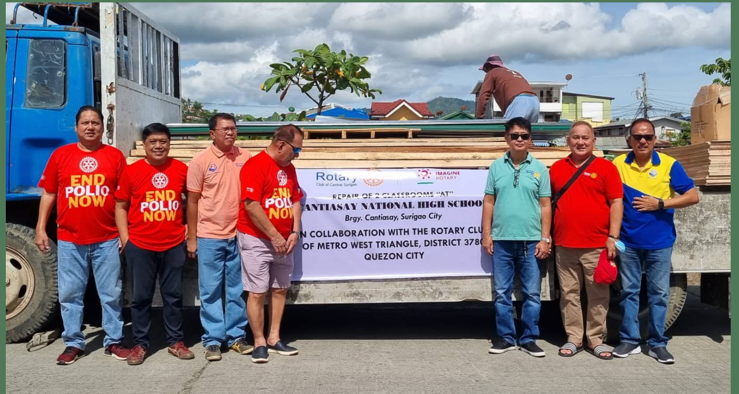
Repair of Classrooms at Cantiasay National High School

In a profound demonstration of their commitment to education and community development, the Rotary Club of Central Surigao has taken up the mantle of leadership by sponsoring and driving the extensive repair and refurbishment of two classrooms at Cantiasay National High School. This laudable initiative is far more than bricks and mortar; it represents a catalytic force that will resonate through generations.